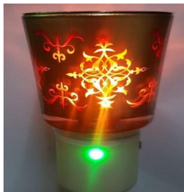
DESIGNER AROMA BURNER WITH NIGHT LAMP