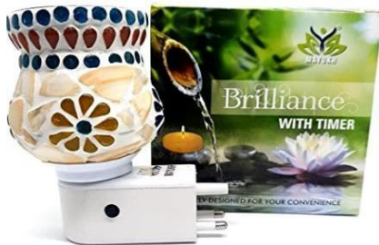
BRILLIANCE WITH TIME

At Sattva Sukun Lifecare Ltd, we are committed to delivering high-quality, innovative, and aesthetically pleasing products that elevate the everyday living experience.