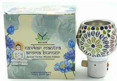
NAV KAR MANTRA AROMA BURNER