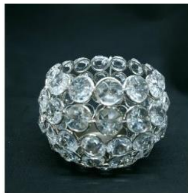
CRYSTAL DESIGN DIYA HOLDER